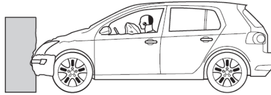
car B: no crumple zone

Here is some information about the two crash tests.