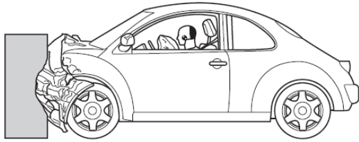
car A: crumple zone

Two cars, A and B , are crash tested by scientists. Car A has a crumple zone but car B does not.