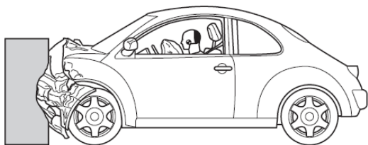
car A: crumple zone

Two cars, A and B , are crash tested by scientists. Car A has a crumple zone but car B does not.