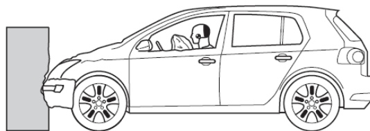
car B: no crumple zone

Here is some information about the two crash tests.